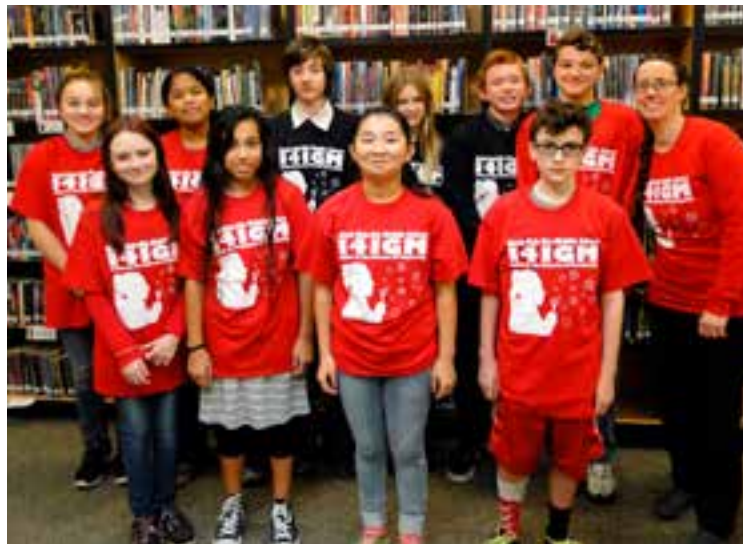
7th & 8th Graders from Neah-Kah-Nie Middle School at the First Lego League in Hillsboro, Oregon

Neah-Kah-Nie Middle School sent a rookie team to the First Lego League Qualifying Tournament in Hillsboro on December 3, 2016. They joined teams from around the Portland area, Jewell, and Seaside to compete in three areas of competition: three trials on a performance field, a project presentation of original research with a solution, and exhibiting the CORE values of First Lego League. Ten 7th and 8th grade students formed a team called I4IGM (The Institute for Idea Generation & Manufacturing).