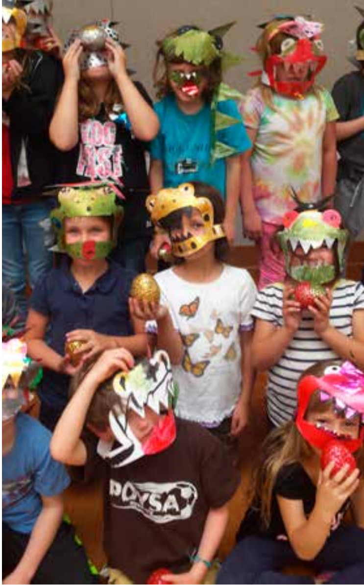
Art Camp 2017

Other activities in the camp were team-building activities