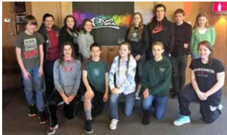
Neah-Kah-Nie Middle School Students at Twin Rocks Friends Camp in Seattle, Washington

The PX2 program brought to light the road blocks in front of the students due to society, self-doubt, negative self-talk, personal circumstances or many other reasons and opened the door to a different pathway of thinking; creating an av-