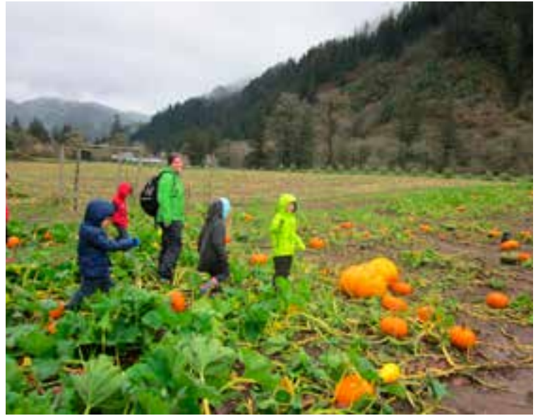
Nehalem Elementary Students at Kilchis Pumpkin Patch

Thanks to the Mudd Nick Foundation, the kindergarten and kindergarten/1st grade classes from Nehalem Elementary went to the Kilchis Pumpkin Patch in October 2016. Despite the blustery, rainy weather, the children, teachers, and parent volunteers had fun.